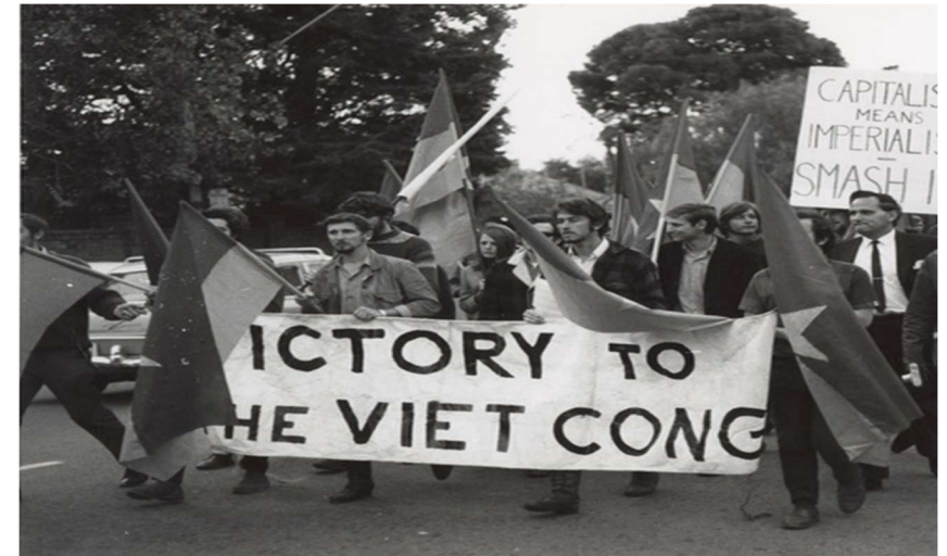
(Anti-Vietnam War March 1970, Adelaide, Australia, banner stating “Victory to the Viet Cong”).

The red and blue flags with the star in the centre held in both photos are the flags of the Viet Cong. The banners read “Victory to the Viet Cong” and “Victory to the Viet Cong: Defeat Imperialism Everywhere.” By contrast, rally after rally over the last fifteen months has focused entirely on “civilian” casualties to the point where Palestinian resistance fighters are represented in an entirely different dehumanized category to Palestinian and calls for a “ceasefire” which depoliticizes the entire anti-colonial struggle as if settler colonialism is not an ongoing war against the Indigenous. The framing of the Palestine rallies and much of the discourse around Palestine has intentionally been premised upon a Liberal anti-war paternalism that prioritises the rights of “Palestinians” as a