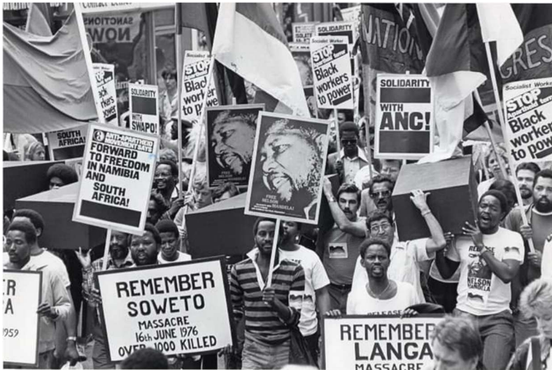
((Anti-apartheid demonstration on 16 June 1985, placards stating “Solidarity with the ANC”, “Remember Soweto”, “Free Nelson Mandela” and “Forwards to Freedom in Namibia and South Africa”).

These exist in direct contrast to the way in which the Western Palestine Solidarity Movement and more specifically the leadership of the BDS Movement relates to the Palestinian national liberation struggle. In the Liberal desire to be seen as legitimate in the eyes of Western politicians, NGOs and media, the BNC has gone out of its way to present the struggle as an integrationist one for Palestinian “human rights” – as opposed to one of national liberation - while disciplining solidarity networks which align themselves politically and strategically to the armed resistance factions on the ground.