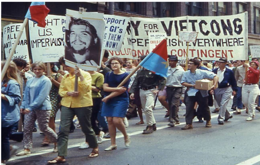
(1968 Anti-Vietnam War March, Chicago U.S.A. Banners stating “Victory for the Viet Cong: Defeat Imperialism Everywhere”).

Take a look at the pictures below, the first from Chicago, 'United States' in 1968 and the second from Adelaide, 'Australia' in 1970. Think about the messaging and how this may be different to the messaging of much of the Palestine rallies we have seen over the last fifteen months.