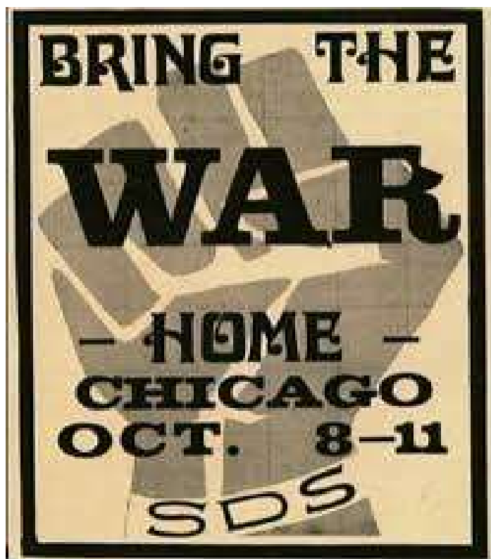
(Bring the War Home – Chicago Oct. 9 th – 11 th SDS.)

Following such tendencies of a militant Anti-Vietnam War movement against the American establishment were the 1971 May Day protests in Washington D.C. These protests brought tens of thousands of anti-war demonstrators to the capital, a result of the culmination of weeks of anti-war activity in the city that spring. Though in contrast to the Days of Rage the protests were framed as “non-violent civil disobedience” the announced goal was to disrupt the basic functioning of the government. The immediate focus