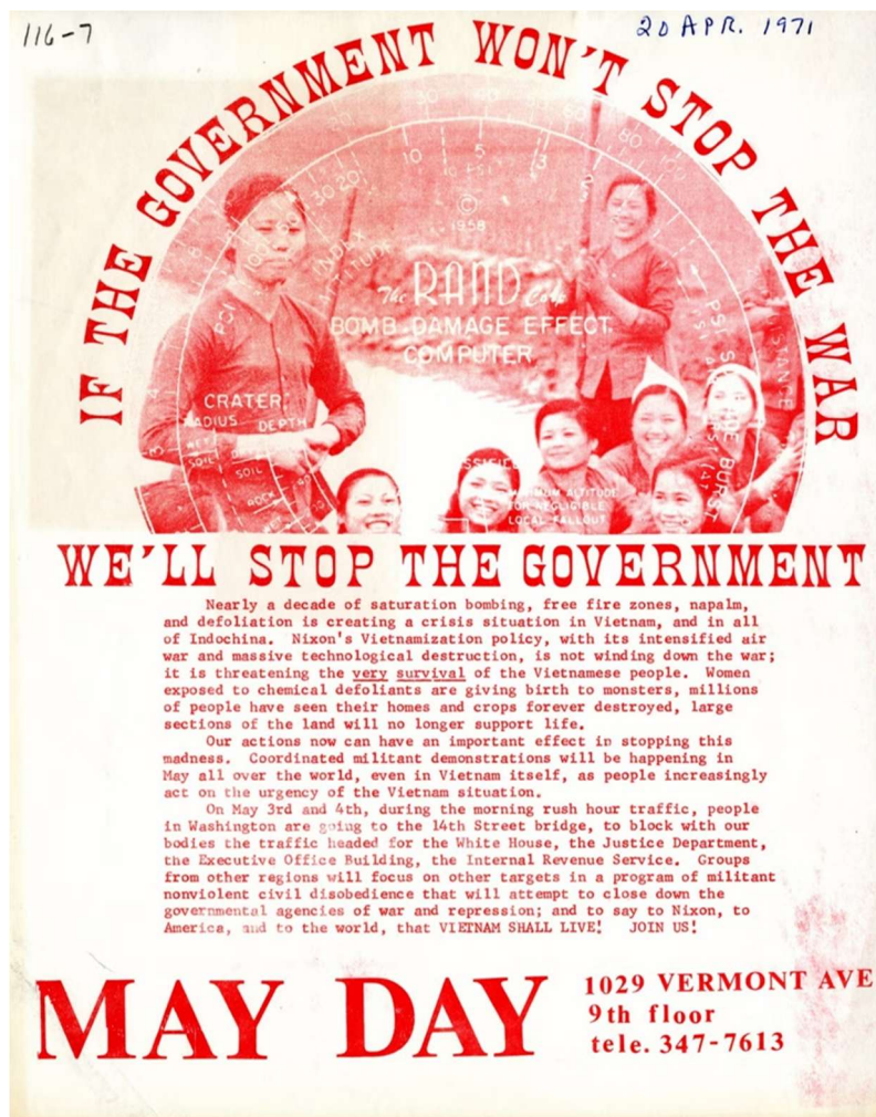
(May Day, "If the Government won't stop the war we'll stop the Government")

"To the Cuban people internationalism is not only a word but something which they have put into practice for the benefit of large sectors of mankind ... The decisive defeat of the aggressive apartheid forces destroyed the myth of the invincibility of the white oppressor... Cuito Cuanavale marked an important step in the struggle to free the continent and our country of the scourge of apartheid." 36 – Nelson Mandela