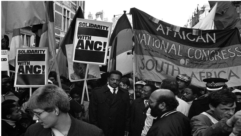
(Protest in London, 1985, with placards reading “Solidarity with the ANC” and a banner reading “African National Congress of South Africa.”)