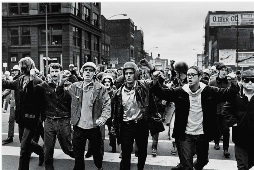
(Leaders of the group then known as Weathermen in 1969, during protests in Chicago: (left to right) Jim Mellen, Peter Clapp, John Jacobs, Bill Ayers and Terry Robbins. Jacobs, Clapp and Ayers would later live for years as fugitives).

For the Weathermen, the call to “bring the war home” signalled the need to raise the social cost of the Imperialist assault on Vietnam upon the American state and its institutions. Recognising that peaceful A to B marches and rallies were fundamentally ineffective in that they accepted the terms provided by the very state to which was being opposed: